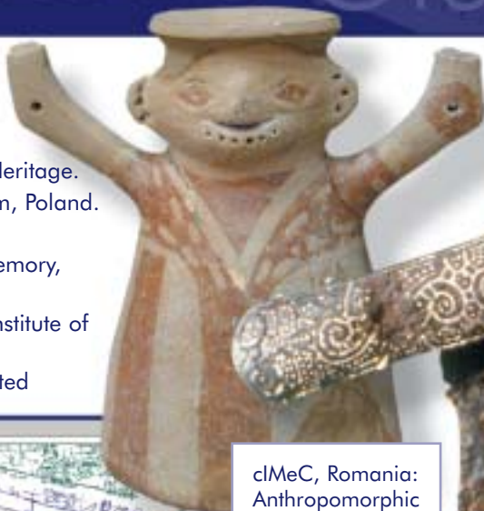
cIMeC, Romania: Anthropomorphic Vase, Enaeolithic, Gumelnitza Culture