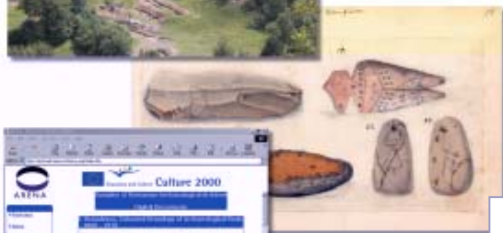
Archaeological finds in Southern Romania (1868-1873), drawing from the Historic Archive of the Institute of Archaeology, Bucharest, Romania