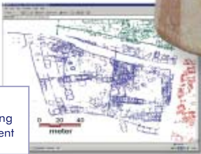
Vorbasse, Denmark: Viking period settlement