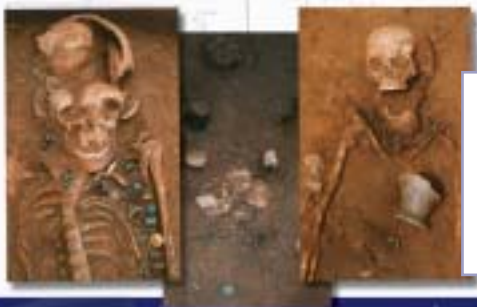
Poznan Archaeological Museum: Kowalewko excavation

For more information on the ARENA project follow the links from our homepage at http://ads.ahds.ac.uk/arena/