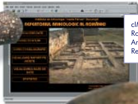
cIMeC, Romania: Romanian Archaeological Reports web-page