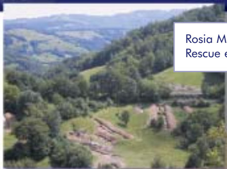
Rosia Montana, Romania: Rescue excavation