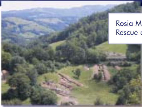
Rosia Montana, Romania: Rescue excavation