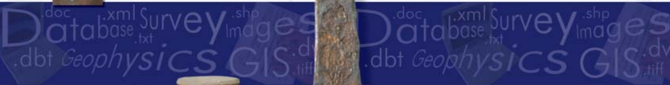
Egge, Norway: Viking Age sword