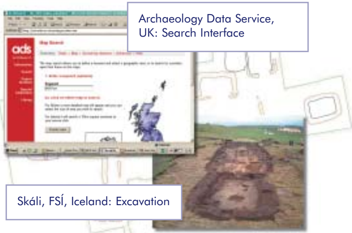
Archaeology Data Service, UK: Search Interface