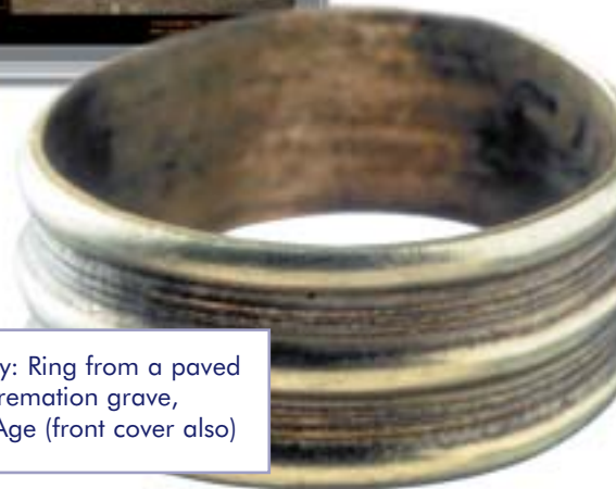
Egge, Norway: Ring from a paved stone circle cremation grave, Roman Iron Age (front cover also)